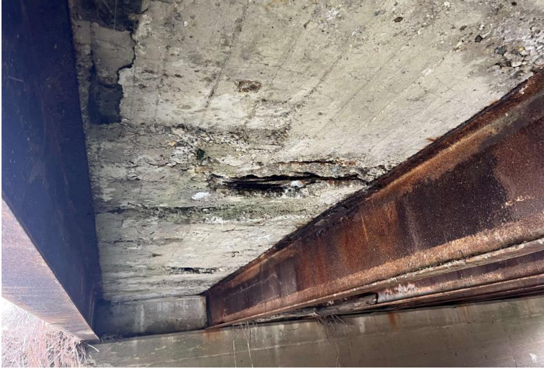
Spalling and delamination throughout deck underside