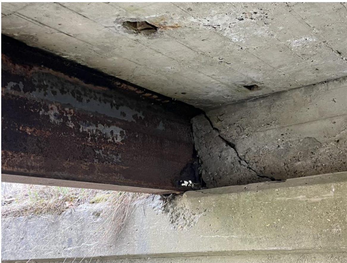
Hole in web of beam at south abutment. An additional three beams have holes in webs.