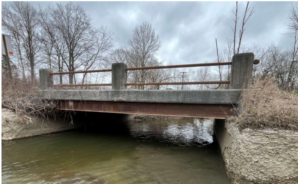
Bridge with outdated railing and heavy rusting