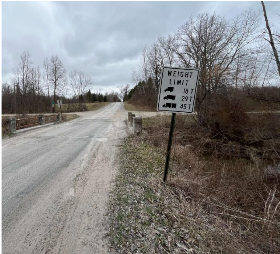
Reduced Load Posting